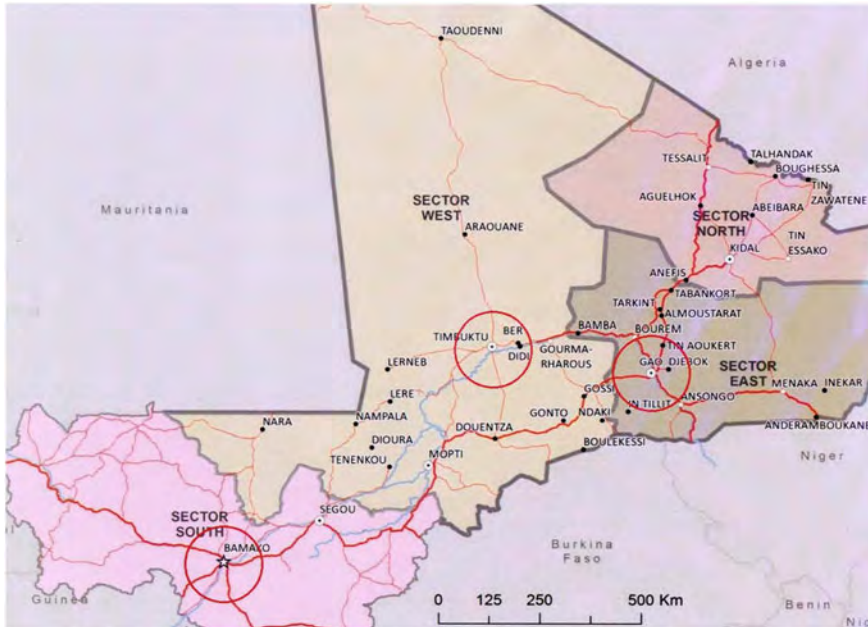
Figure 9.2 Map of Mali with relevant geographical positions.

In order to understand the operation of ASIFU and the mission’s other military intelligence units, the researchers on this project conducted 93 semi-structured interviews with key MINUSMA personnel (mostly from The Netherlands) who had been deployed between March 2014 and December 2015. We also analyzed