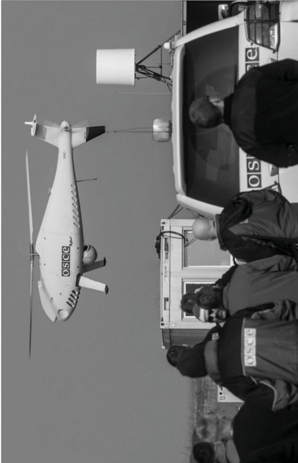
Figure 1. (A) The long-range UAV used by the SMM, both an electro-optical (visible light) and an infrared (thermal) camera in the pod (undercarriage ball). 31