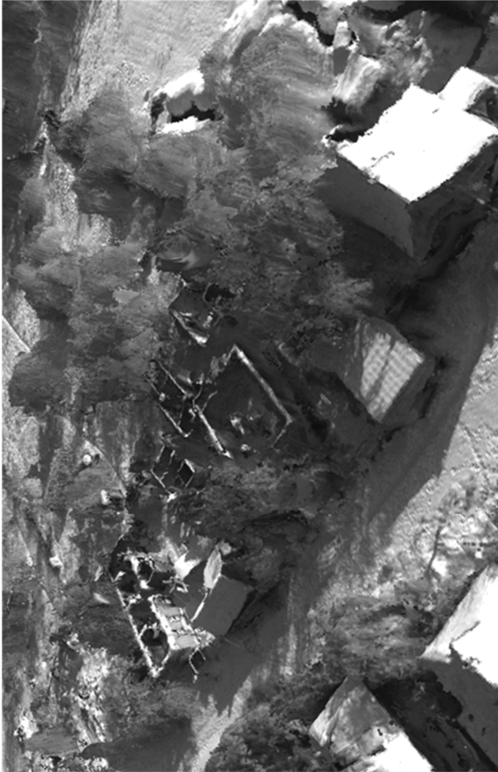
Figure 1. (C) Images converted to 3D rendering of war-damaged dwellings.