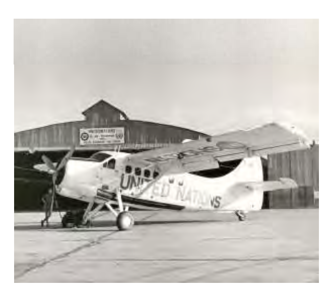
Canadian Otter of 115 ATU at EI Arish Airport

The main heavy transport Squadron put into action was 435 based at Namao / Edmonton. Within 2 days of being ordered to the Mediterranean the first CC-119G "Flying Boxcar" was in service with the UN. Capodichino airport near Naples, Italy was where 435 Squadron was based and later joined by 436 Squadron. All types of cargo and personnel from many nations were airlifted into Egypt to help start an historic world police force. The mission task was to airlift troops, mail and equipment the 1300 miles from Naples to Abu Suweir airport in Egypt near the Suez Canal. The trip was long and the crews found problems with the desert sand and the available navigational facilities. flying was required to stay within the very narrow Egyptian air corridors. In 1957 the RCAF transport squadrons moved from Abu Suweir to the refurbished El Arish airport. This airlift mission lasted until the "Six Day War" of 1967.