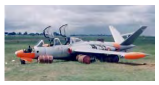
Captured Fouga Magister at Elizabethville Airport

As soon as the first UN troops had arrived in the Congo, Patrice Lumumba wanted them to take back Katanga by force. The UN refused his request. Following a previous Resolution, Resolution 146, dated 9 August 1960, was passed and it mentioned Katanga and contained written provisions that allowed UN troops to enter Katanga, but not to intervene in any internal conflict. Lumumba then launched an attack on Katanga, but the attack failed. Patrice Lumumba was then dismissed by President Kasavubu and replaced by the Chief of the Congo Army, Joseph Mobutu. Lumumba later went to Elizabethville, where he was tortured and executed.