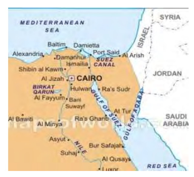
Location Map of UNEF I Operation Area

observers carried aboard were looking for any preparations for war, any troop movements and in addition trying to keep the Armistice Demarcation Lines secure. High desert temperatures of up to 100 F (38C) and higher made for bumpy air which made the mission very uncomfortable for the observers. Sometimes scorching winds would whip up sandstorms reducing visibility drastically for the pilots and severely degrading the safety of the flight environment. The patrols ranged from the Mediterranean down the Sinai Peninsula to Sharm el Sheik at the southern tip of the peninsula where it meets the Gulf of Agaba. Another task was the air re-supply of the UNEF outposts manned by troops from Finland, Sweden and Yugoslavia. Members of the Royal Canadian Army Signal Corps (RCASC) attached to the unit operated the ground to air signal equipment at El Arish and Sharm el Sheik.