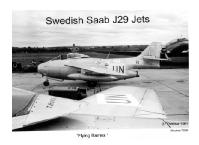
Swedish Saab J29 Jets

to meet Tshombe. Sadly, Hammarskjold's plane crashed and he was killed along with 15 others. He was replaced by U Thant who agreed to another attack on Katanga in December 1961. The UN Commanders now knew that they had to create a "ONUC Air Force" to give them offensive air Ethiopia contributed F-86 Sabre Jets, Sweden provided Saab J29 Fighters, and the Indian Air Force sent Canberra Bombers. All of the aircraft assembled now gave ONUC a formidable "air force". At the UN Security Council, Resolution 169 was passed on 24 November 1961 giving UN commanders the authorization to expel mercenaries from Katanga. The next event that triggered UN action was the shooting down of a UN observation helicopter by Katangan forces. UN commanders then ordered an offensive to take