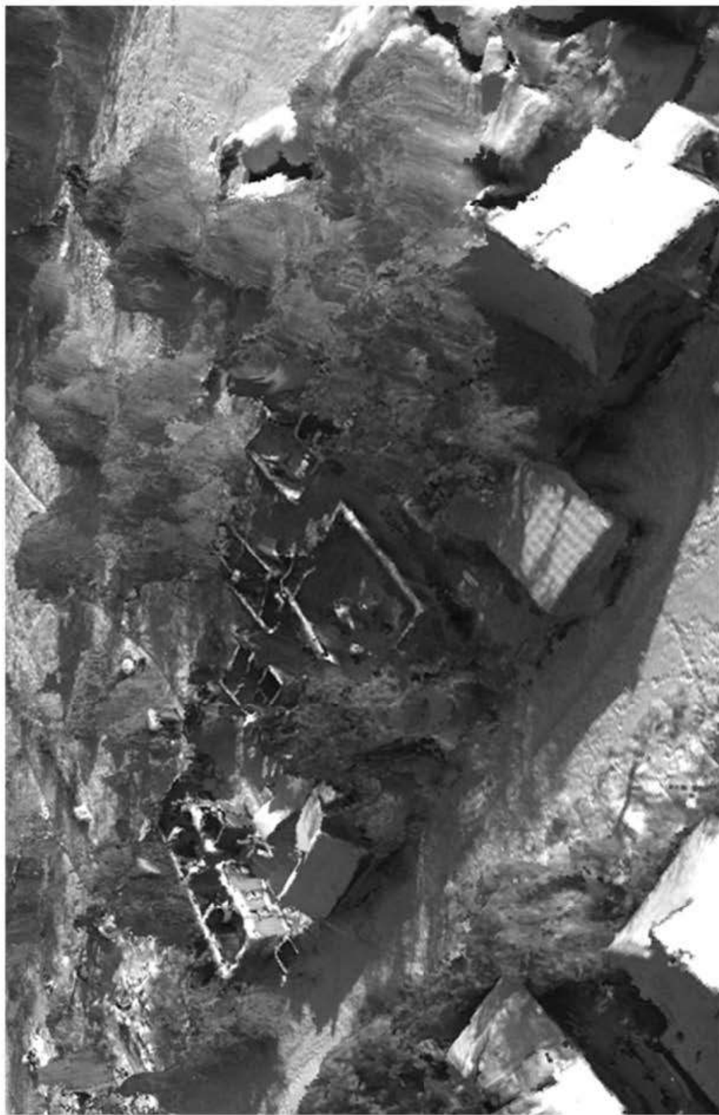
Figure 1. (C) Images converted to 3D rendering of war-damaged dwellings.